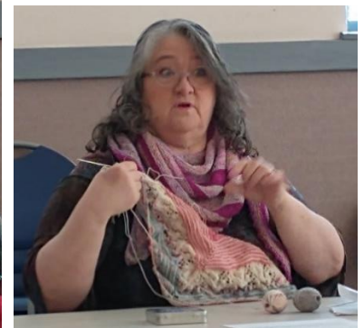
Shelley - Shawlette