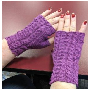
Shelley’s Fingerless Gloves