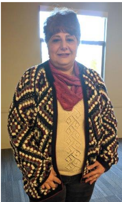
Nazee– Crocheted Cardigan