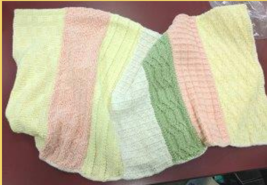
Donated Baby Blanket