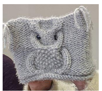
Arlene - Owl Hat

Nazee asked if people would be interested in a group knit-a-long. Contiguous Knitting. Nazee will look into it. Group in Ravelry Nazee asked if people would be interested in a group knit-a-long. Contiguous Knitting. Nazee will look into it. Group in Ravelry.