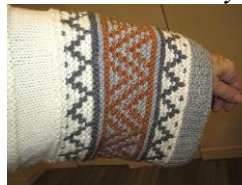
Ariane – Boho Mosaic cardigan