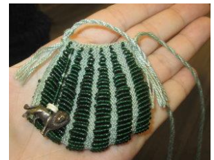
Kathleen – beaded bag