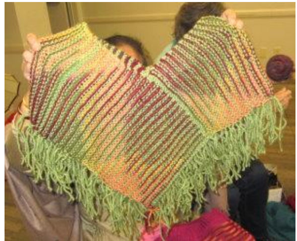
Radhika – Little girl poncho