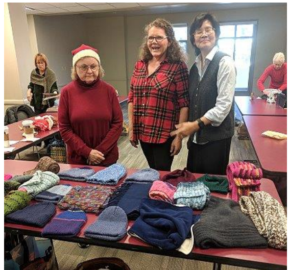
Scarf & Hat Donations for St. Anthony's Scarf Drive