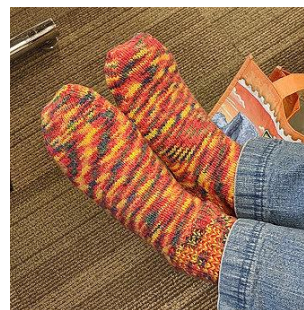
Tamara - First Socks 😊