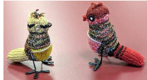
Lois - Birds