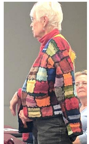
Lois Multi-color Cardigan