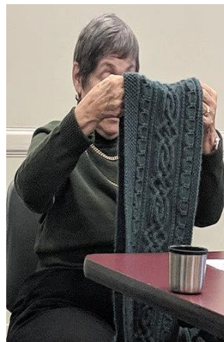
Claire's Celtic Afghan