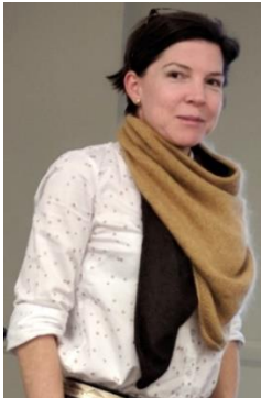
Athos in Shibui Yarn