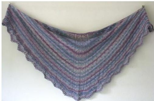
Nazee – Published Knit Shawl pattern