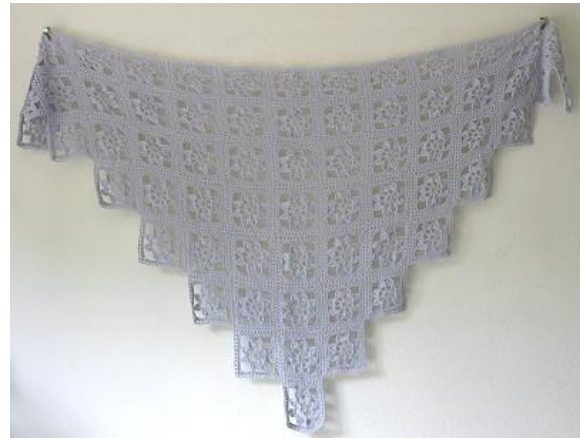
Nazee – Published Crochet Shawl pattern