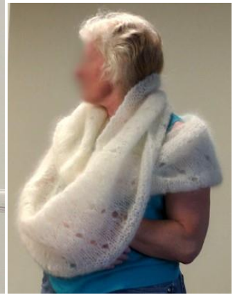
Kathrine – Mohair Cowl