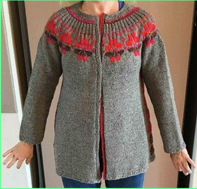
Sweater by one of the members