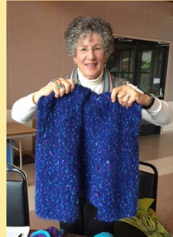
Elaine - Vest