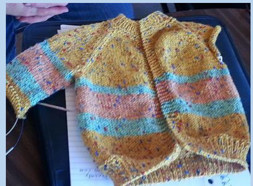
Dana baby sweater