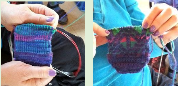
Marilyn's socks – using two handed 2 color knitting method

Radhika is working on a linen stitch scarf with yarn from Uruguay