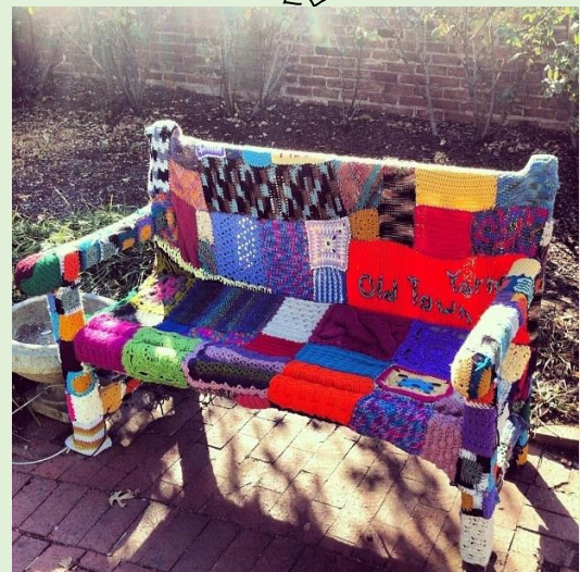
Yarn bombing – Patchwork bench – at an event sponsored by The Fredericksburg – VA Area Museum & Cultural Center