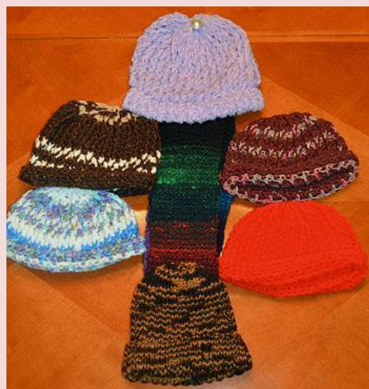
Hats and scarf donated for Scarving Artists – St. Anthony's scarf donation project